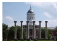
Columbia Bucket List